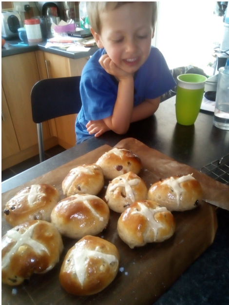
And housework!! This is very impressive.. Well done you two.