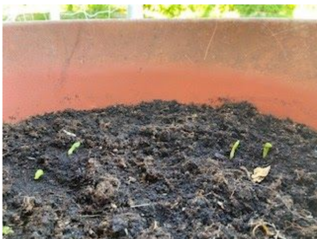
Alfie and Rocco's seeds have begun to grow! Well done boys. Can you see the tiny shoots?